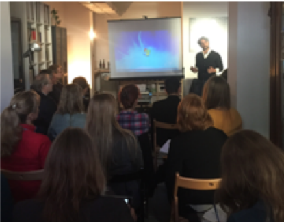
FEN-Meetings in Paris, Bilbao, Florence