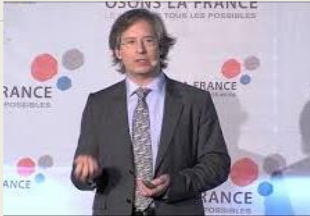
Riel Miller, UNESCO

Three basic competences of Futures Literacy according to Riel Miller are: